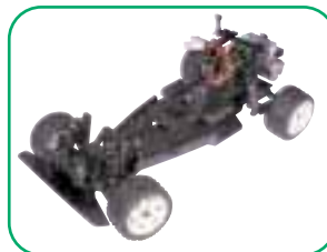
SuperTen Sports 'Rally' EP 2WD

The only thing that these cars have in common with the SuperTen series, is their physical size, having similar dimensions to the SuperTen series. SuperTen Sports series cars are based on modified Outrage (EP) and Sandmaster (GP) chassis, using shorter suspension arms and drive shafts to allow more in-scale body shells to be fitted. Featuring glass-filled nylon chassis, fixed length upper and steering arms, plastic bodied oil filled dampers, a geared differential and stock 540 motor or GT12 pullstart engine. They were supplied partially assembled, the SuperTen Sports range was designed for rough-road use. Due to the high damper stays fitted to these cars, they are not suitable for use with SuperTen series GT body shells. Now discontinued.