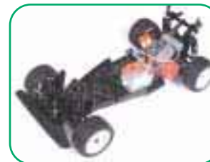
SuperTen Sports 'Rally' GP 2WD

SuperTen Sports series chassis are of the following approximate dimensions: