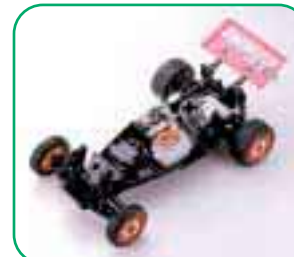
Sandmaster GP 2WD