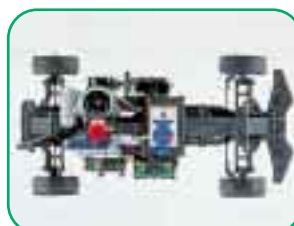
Mantis GP Rear Wheel Drive