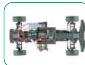
Mantis EP Rear Wheel Drive