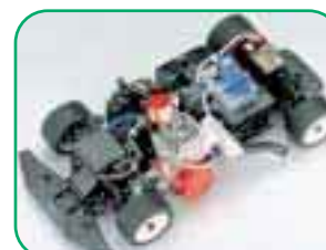
Mantis GP FF Front Wheel Drive (PetitTen)