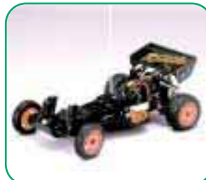
Outrage EP 2WD

Kyosho's EP Buggy has formed the basis for many variants, including Stadium Trucks, Monster Trucks, Touring Cars, Rally Cars (SuperTen Sports) and an RTR version. The Outrage is 2WD and features a glass filled nylon chassis, fixed length upper arms, fixed length steering arms, plastic bodied oil filled sprung dampers, a geared differential and stock 540 motor. It has been supplied partially or fully assembled or in kit form. The Outrage range was designed for rough-road/off-road use, depending on the type of body shell oil dampers, wheels and tyres fitted.