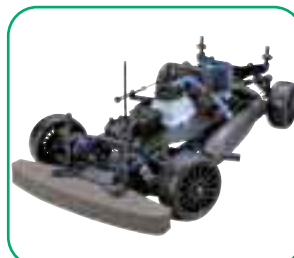
V-1R 'Touring' GP 4WD

Note: There is a lot of parts commonality and interchangeability between V-1R and V-1S GP.